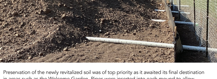
in areas such as the Welcome Garden. Pipes were inserted into each mound to allow drainage and provide aeration. Drainage displaces water and allows nutrients to flow into and remain in the soil, and aeration reduces compaction and oxidization.