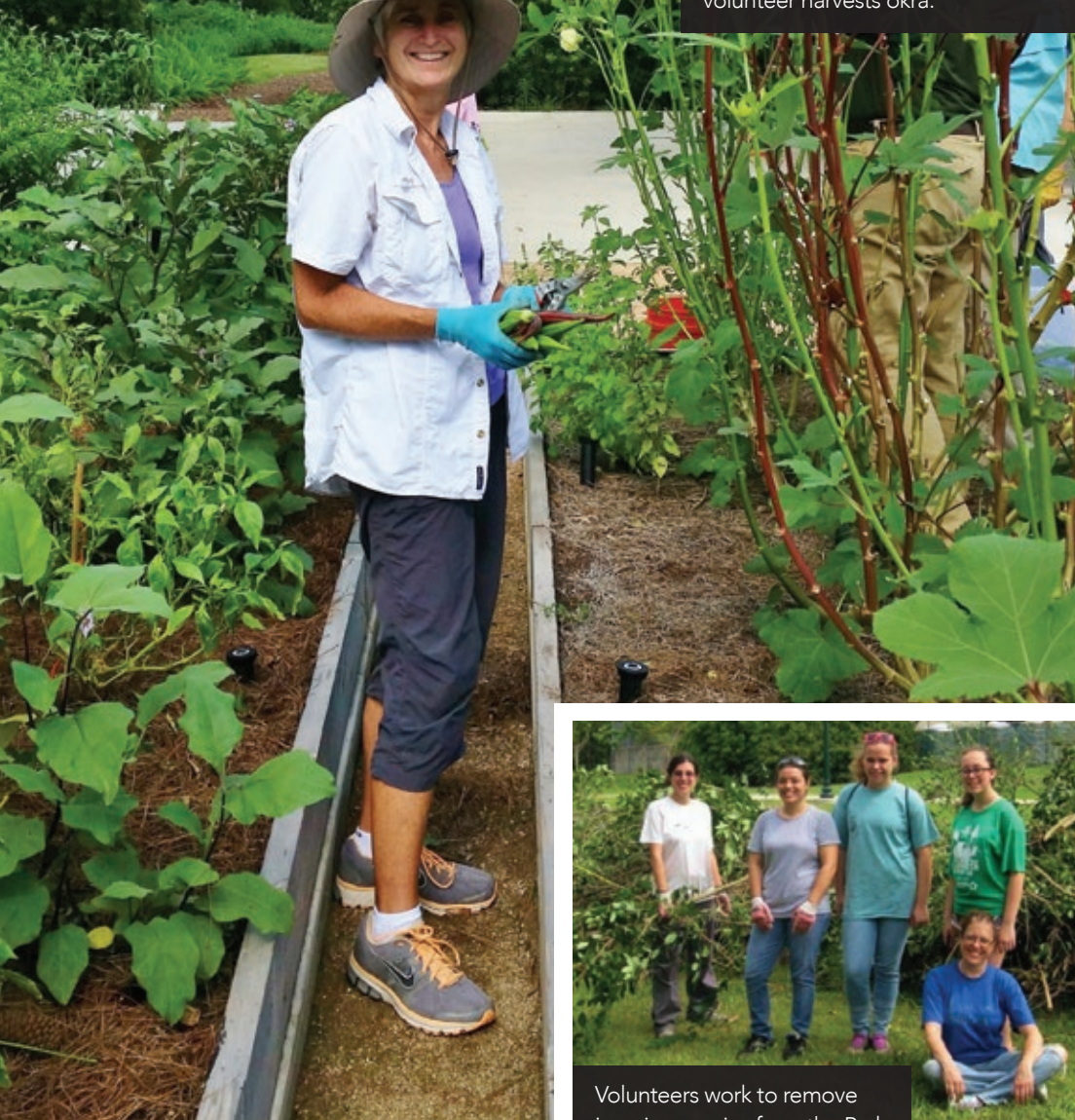
invasive species from the Park.