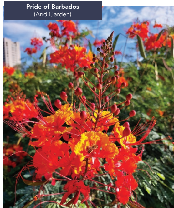
Pride of Barbados (Arid Garden)