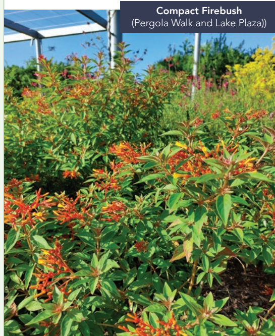
Compact Firebush (Pergola Walk and Lake Plaza)