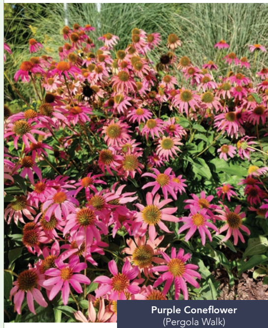
Purple Coneflower (Pergola Walk)