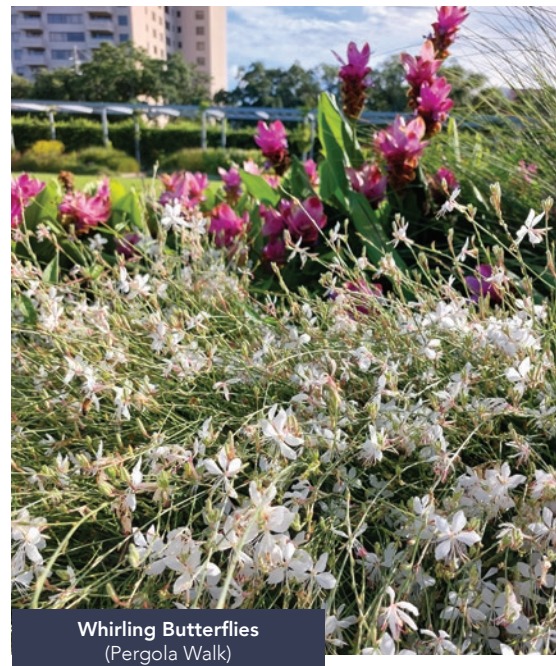
Whirling Butterflies (Pergola Walk)