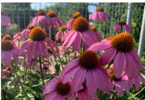
Gardens in Full Bloom Page 5

MISSION Hermann Park Conservancy is a citizens' organization dedicated to the stewardship and improvement of Hermann Park—today and for generations to come.