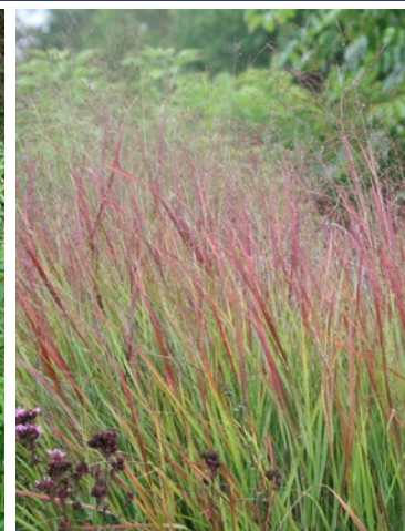
Left to Right: Dotted Gayfeather; Inland Sea Oats; Switchgrass