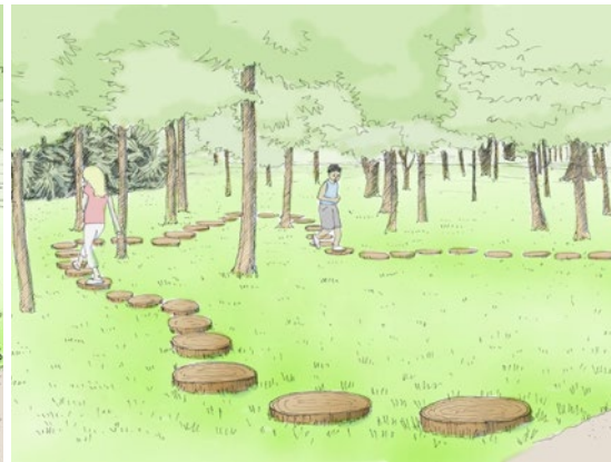
White Oak Studio's preliminary sketches of the future nature encounters play area.

Hermann Park Conservancy and PNC Grow Up Great are teaming up to create a new learning and play space in the heart of Hermann Park. This new nature-focused area – geared towards children of all ages – encourages physical play and provides sensory experiences that help develop cognitive function. White Oak Studio is working with the Conservancy on the reforestation plans for the area, while helping weave these nature vignettes within the trees to provide children with challenging, nature-based interactives.