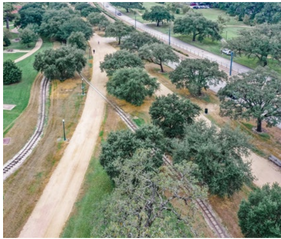
Lifted Up Aerial Photography

Signs posted around this 8-acre site explain the seeding process and display what kind of plantings will be blooming in the future. If you're ever riding the Hermann Park Railroad, you'll be able to pass right by it!