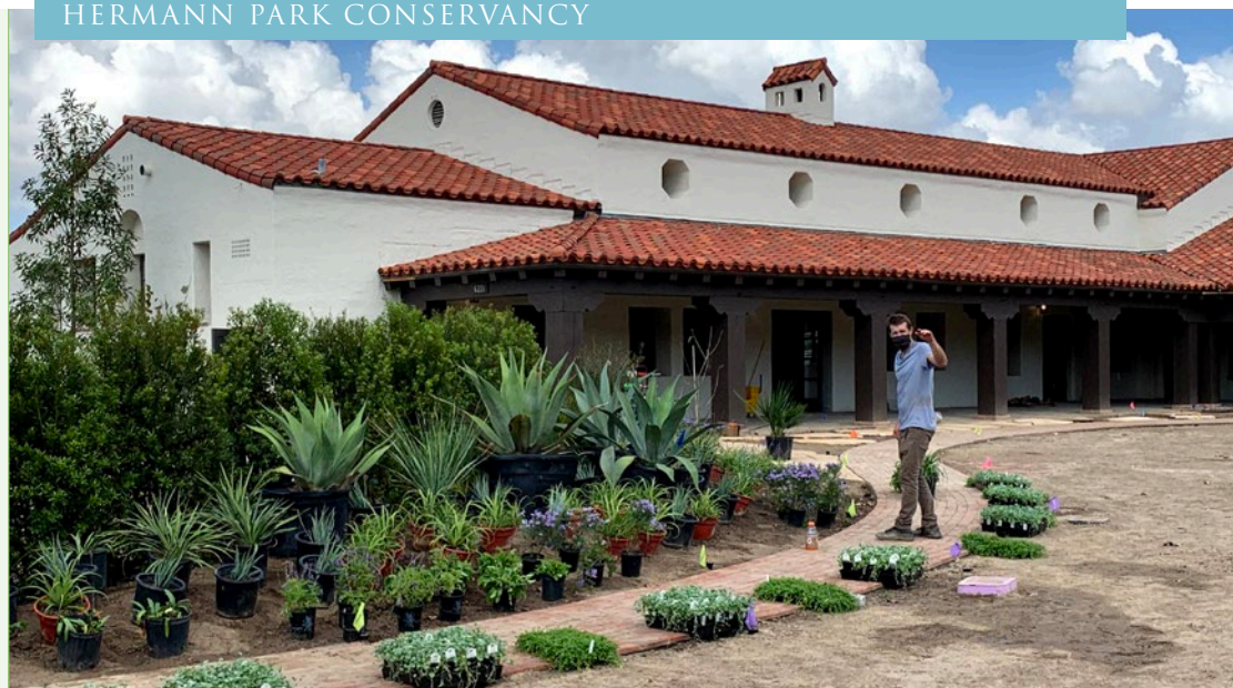
Jack Ohly from MVVA planting away on-site at the nearly completed Lott Hall.