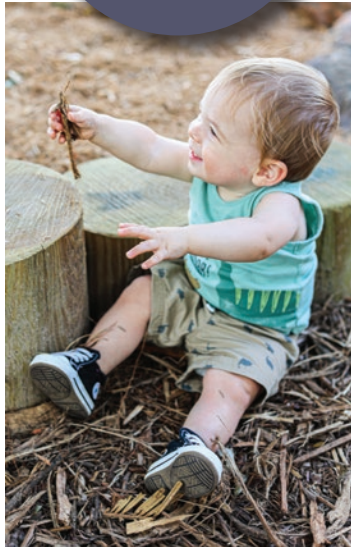
PNC Photos by GKP

3,581 PNC employees voted to decide on the final name.