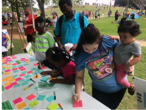
Community members share what they want to see in Hermann Park at Kite Festival

There is joy in getting involved. This spring we also welcomed an exuberant community-based art project, "Color Bursting Hermann Park," which invited individuals from across the city to create colorful vests and skirts donned by some of Hermann Park's iconic trees. And tens of thousands attend the many marvelous programs that take place here, like Park to Port Bike Ride or our free gardening classes and story hour in the McGovern Centennial Gardens.