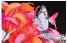
HATS IN THE PARK see pages 4-5

MISSION Hermann Park Conservancy is a citizens' organization dedicated to the stewardship and improvement of Hermann Park—today and for generations to come.