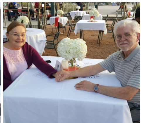
Happy couples were all around at the annual Valentine's Day "Dinner and a Cruise"