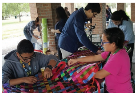
Students from YES Prep creating tree vests