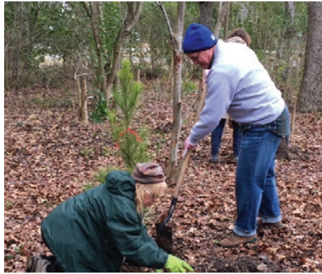
Volunteers plant the newly donated trees in Bayou Parkland

Throughout late winter and early spring, HPC staff and volunteers joined together to plant 50 trees that were generously donated through Apache's Tree Grant Program. The gifted trees represent a variety of native trees that thrive in Hermann Park, including loblolly pine, bald cypress and wax myrtle. Most of