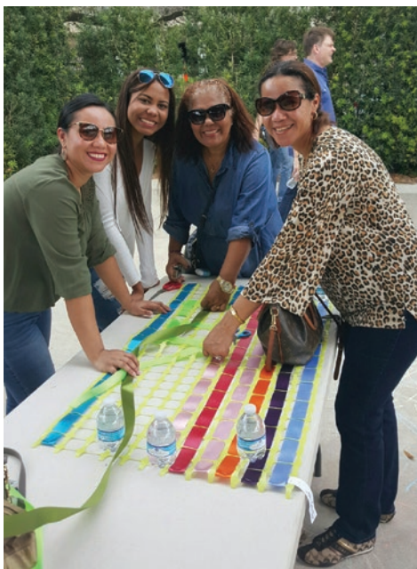
Community members work on creating colorful tree vests