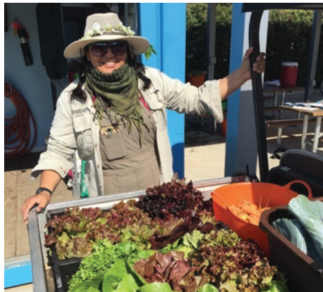
HPC staff loads up produce from the Family Garden to be donated

The winter months hit the McGovern Centennial Gardens hard, but thanks to the help of our committed community volunteers, the Gardens are ready for a budding spring season!