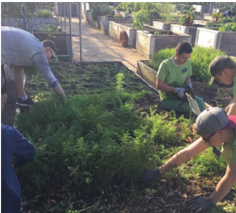
Volunteers harvesting in the Family Garden