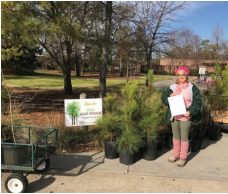
Trees from Apache's Tree Grant Program arrive