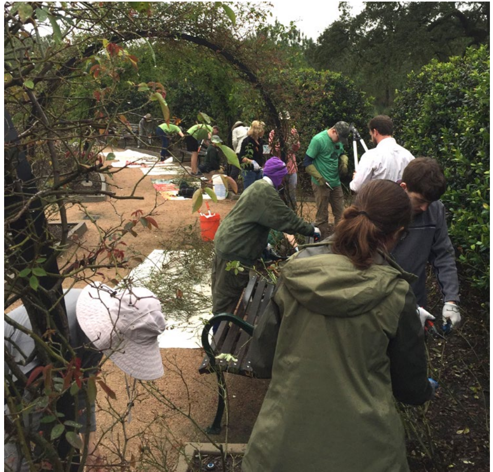
Volunteers work in the Rose Garden

some of their resident elephants enjoyed chewing on their stems. Later in the evening, a sell-out crowd enjoyed HPC's annual "Dinner and a Cruise" at Pinewood Cafe where sweethearts enjoyed dinner on the terrace before pedal boating out on McGovern Lake.