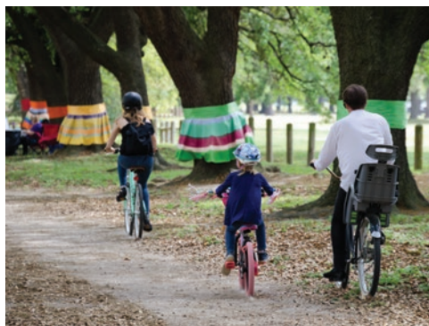
A family bikes by "Color Bursting Hermann Park"