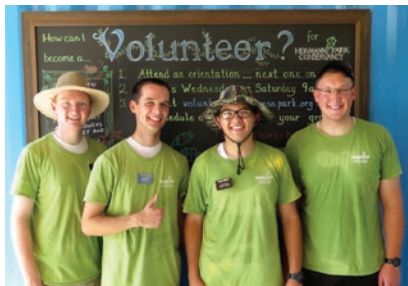
Dedicated volunteers help to keep the Gardens growing

But we don't do it alone. I often refer to Hermann Park as a "miracle of community engagement." Each year, we see hundreds of individuals from the local community contribute more than 20,000 hours of their time through our volunteer program. We saw volunteers contribute to the regrowth of the McGovern Centennial Gardens after an unusually cold winter, and many are getting trained in special techniques to help with the Japanese Garden or restore our native habitats.