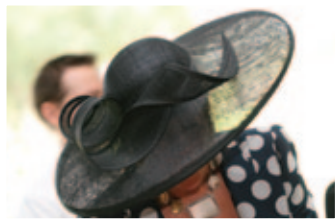
HATS IN THE PARK see pages 4-5

The Greenway trail, which winds through the golf course, will be open throughout the renovation, allowing walkers to complete a half-loop until improvements are finished. Like the Greenway trail, the updated trail will have a new decomposed granite surface with concrete edges and will be lined with attractive lighting.