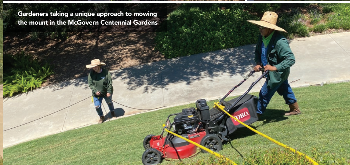
Gardeners taking a unique approach to mowing the mount in the McGovern Centennial Gardens