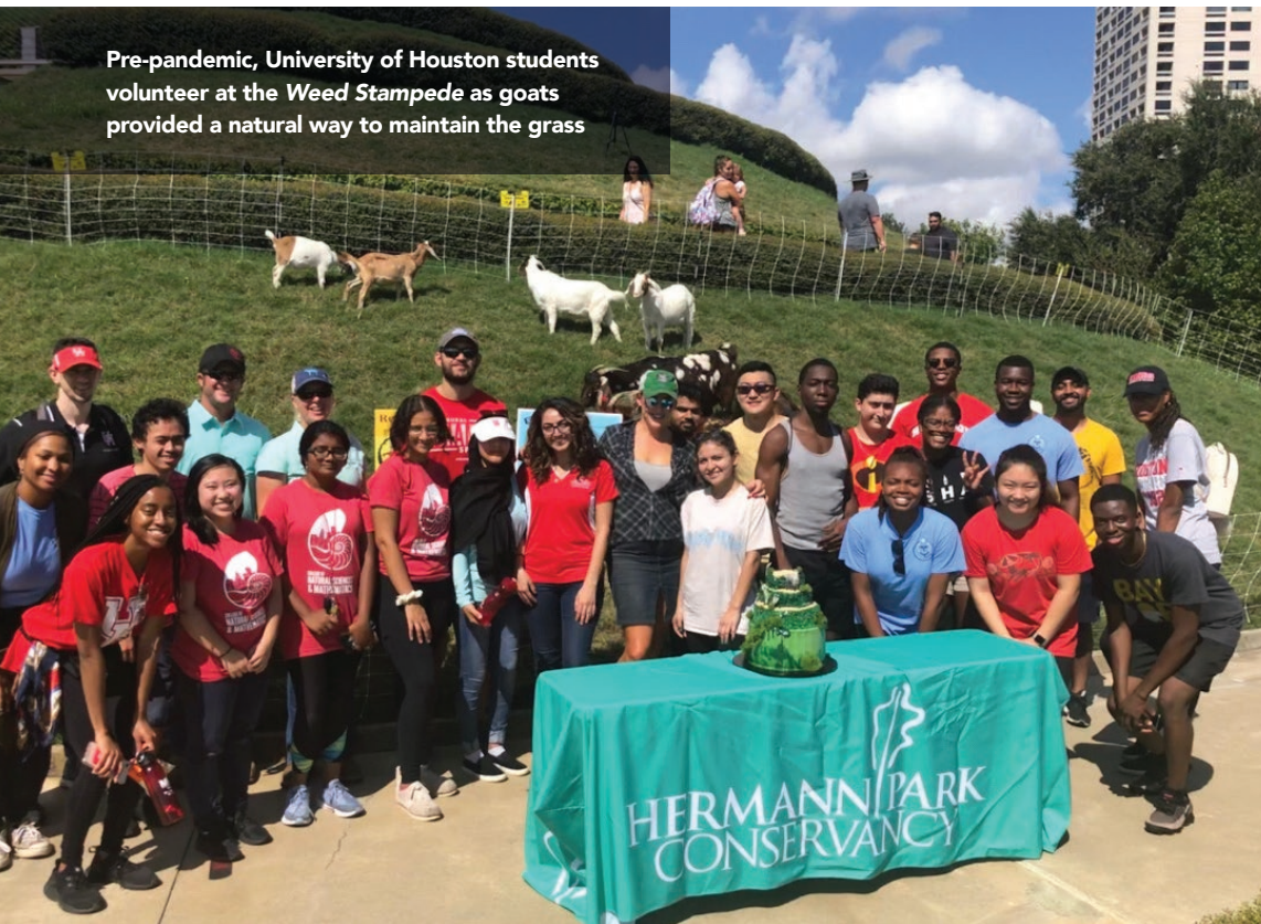
Pre-pandemic, University of Houston students volunteer at the Weed Stamped as goats provided a natural way to maintain the grass