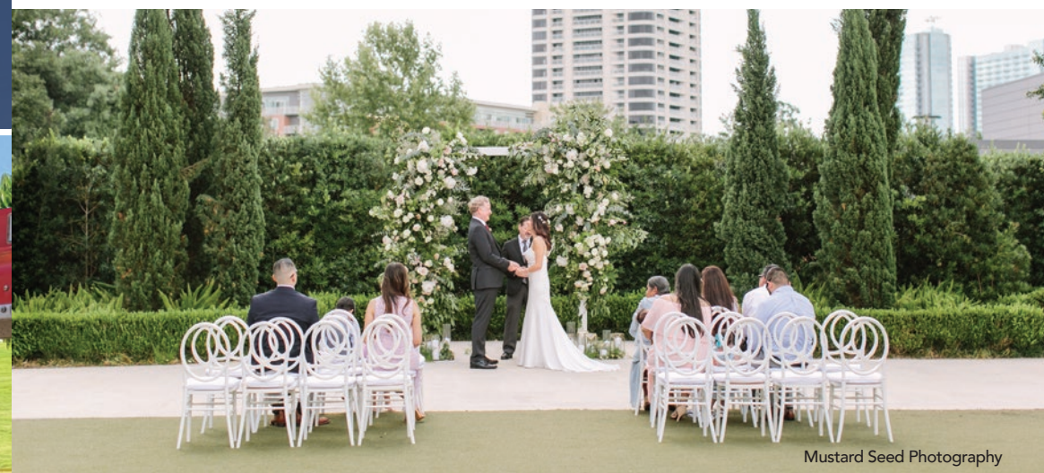
Mustard Seed Photography