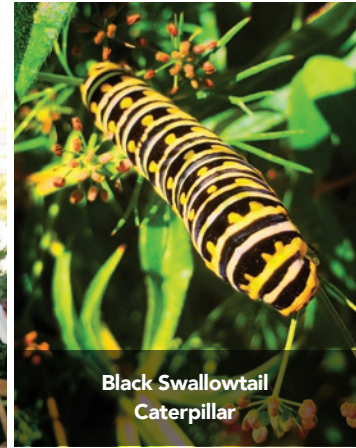
Black Swallowtail Caterpillar