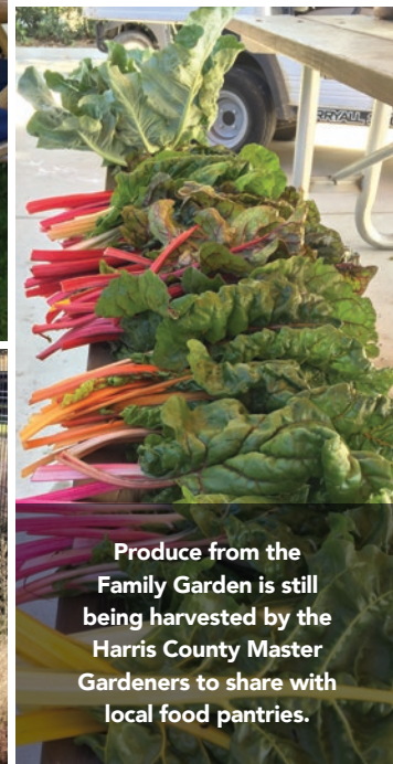
Produce from the Family Garden is still being harvested by the Harris County Master Gardeners to share with local food pantries.