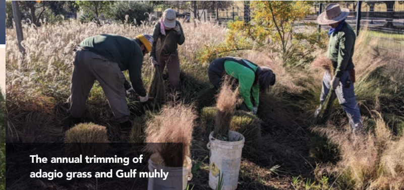
The annual trimming of adagio grass and Gulf muhly