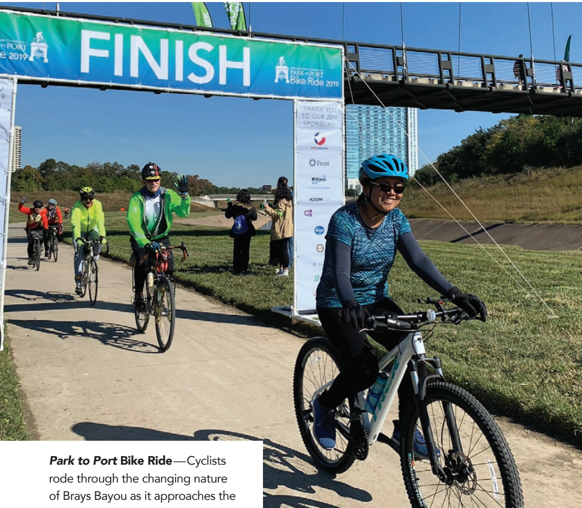
Park to Port Bike Ride —Cyclists rode through the changing nature of Brays Bayou as it approaches the Port of Houston.